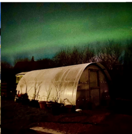
Lorraine in Orphir