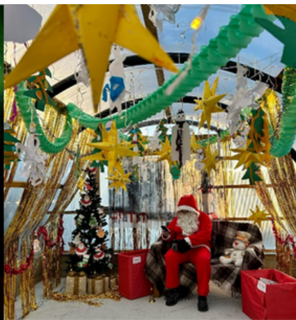
Wastview Care Centre's Christmas Grotto Crub