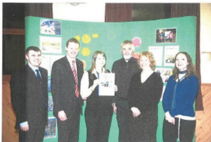
Launch of Tourism Plan

As we approach our third year since launch of the Development Plan and set forth with a Change o Ert , we decided to update the plan and consider some of Northmavine's achievements along with projects and issues we intend to address in the future. In line with community input and the Development Plan, our main focus will centre round the issues of Housing, Business Units and Renewables. Work has already started on the housing issue with an empty properties survey and a housing needs survey and will continue dependent on community need and survey results.