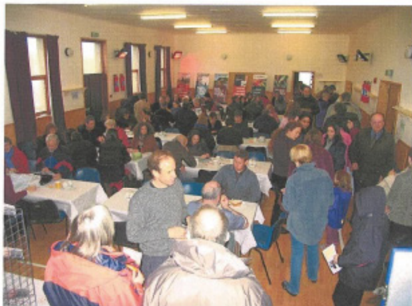
Launch of Northmavine Development Plan

There was a clear will to tackle challenging problems and a desire to develop and regenerate Northmavine. These suggestions formed the core themes of the local Development Plan. They testify to the strong sense of community felt throughout the area and reinforced the genuine sense of pride which folk have in Northmavine. The Northmavine Development Plan was launched on 29th May 2005 and covered ten main headings including;