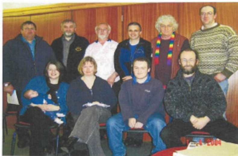
Original Development Group

The main priority was to put together a Development Plan for Northmavine. By December 2004 a highly successful programme of community consultations had been carried out, based on '8 o'clocks' evenings at each of the main community halls in Northmavine. Nearly one quarter of the population contributed to this overall consultation process. Participation by the community in these consultations was highly productive, with a wealth of positive, practical and creative suggestions being put forward.