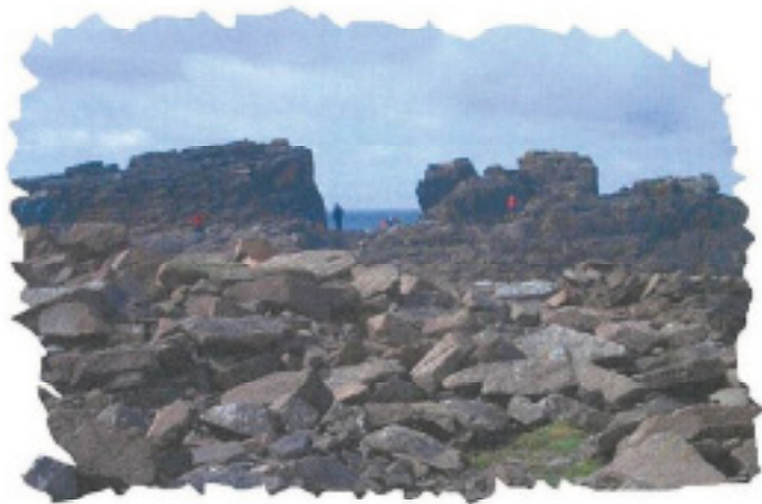
Geologists admire the fantastic "storm beach" – Grind O Da Navir

We are committed to preserving and developing these resources.