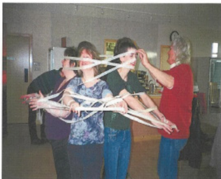
Directors are often very "tied up"!

In order to bring forward projects, our volunteer directors rely on staff members. Although our volunteer directors are committed to the aims and objectives of the company, all are in full-time employment, making the project worker post an essential part of the day to day running of the company. The only direct funding we receive through the latE Scottish Office initiative, pays for office/administration costs and the salary of our project worker.