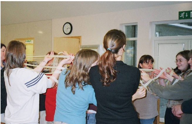
'Da young eens' have fun during the UR Nortmaven consultation project

Last year the NDC received funding from the Scottish Policy on Architecture National Programme Innovation Fund through an organisation called The Lighthouse .