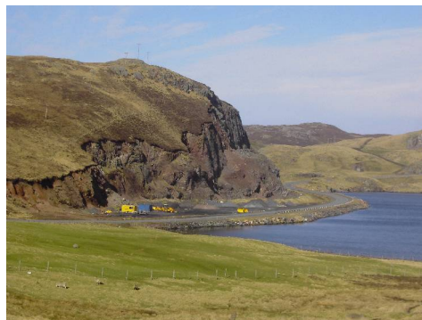
Mavis Grind—'The Gateway to Northmavine'

The building itself can be found by turning right at the Hillswick/Ollaberry junction, if travelling from the south, and carrying on along the main road past the red phone box at the Leon junction, past the Barnafield signpost and on to the top of that hill where you will see a red corrugated iron shed to your left and a winding road down to your right taking you to a yellow house set in a very pleasant mature tree plantation. That is us! Call along any time or phone for an appointment.