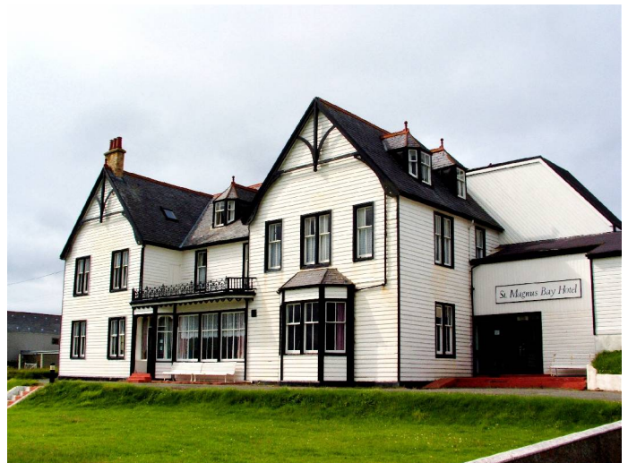
St Magnus Bay Hotel